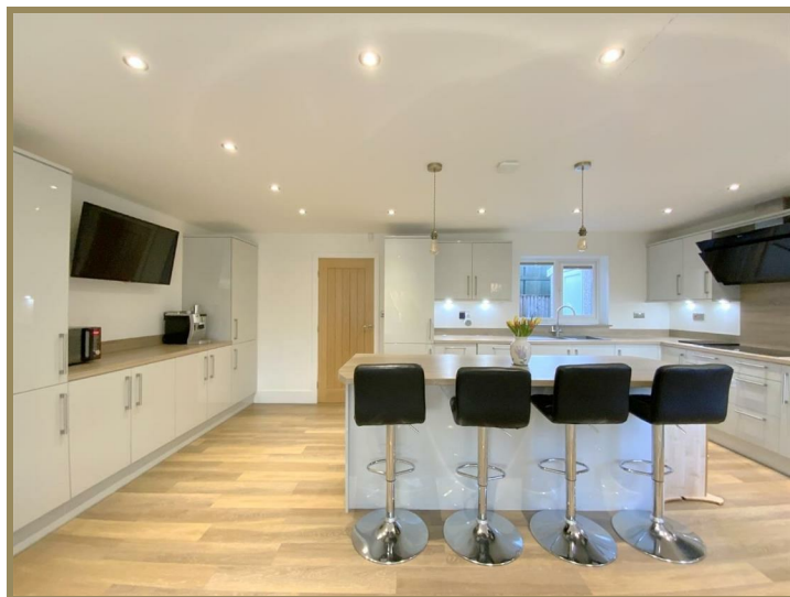
Brocklesby House Thoresby Road, Tetney, DN36 5JR £460,000